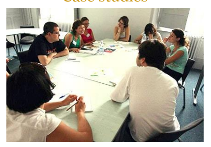
Immersions, living lab